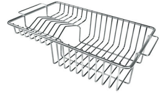
GRILLE PORTE-ASSIETTES INOX 250x425 A100 B01